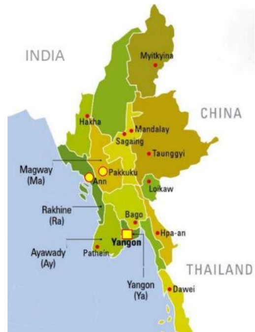
Our areas of work: Yangon, Ann (Rakhine State) and Pakokku (Magway Region)

After initial steps in 2017 - a brick production and grocery shops in Yangon and Ann - we changed the focus in 2018. With additional projects in the areas of Ann und Pakokku families will be able to secure their income and finance the education of their children.