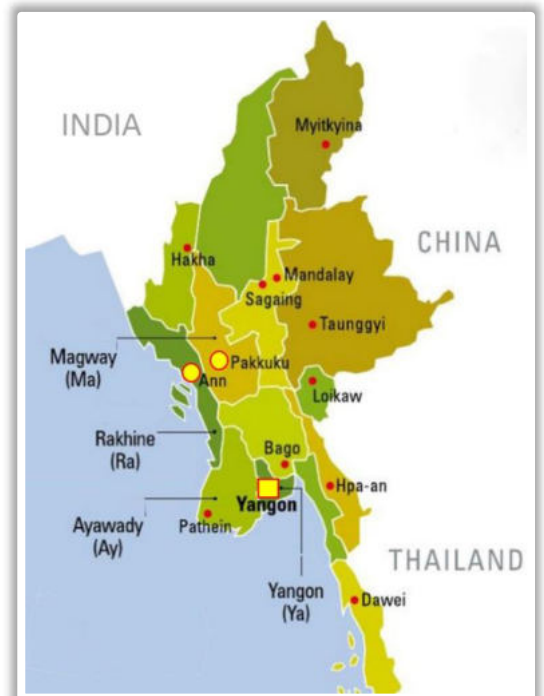
Our areas of work: Yangon, Ann (Rakhine State) and Pakokku (Magway Region)

The number of projects has continuously grown and their diversity has increased. It is very positive that already 13 people have successfully completed their projects and paid back their loans. Three of them have applied for bigger loans to start new projects. We are pleased that in 2019 we have been able to reinvest the amount of about CHF 17'500 of loans paid back into new projects.