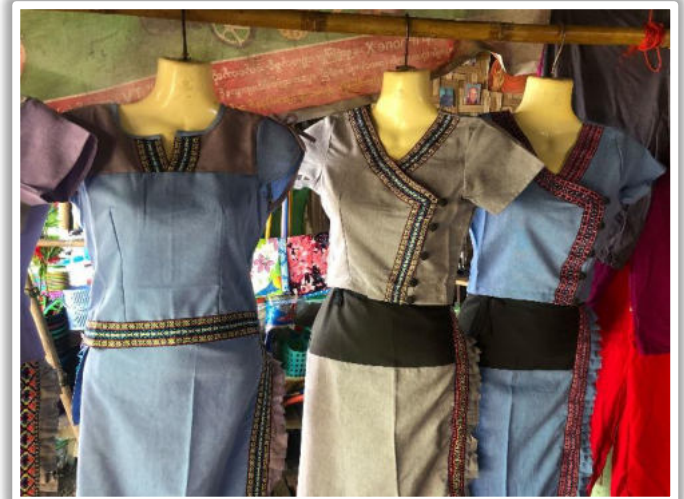
Clothes in the shop of the tailor Zapaw

It is good to see that in addition to microcredits for cashew plantations project plans for loans to plant other fruits and and vegetables as well as for digging water wells and sewing clothes were submitted.