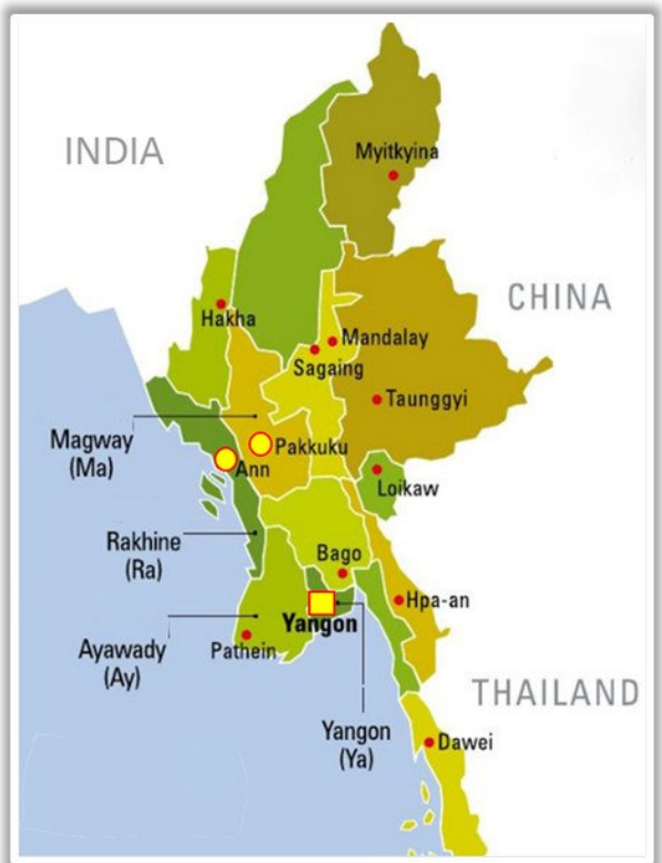
Our working areas: Yangon, Ann (Rakhine State) and Pakokku (Magway Region)