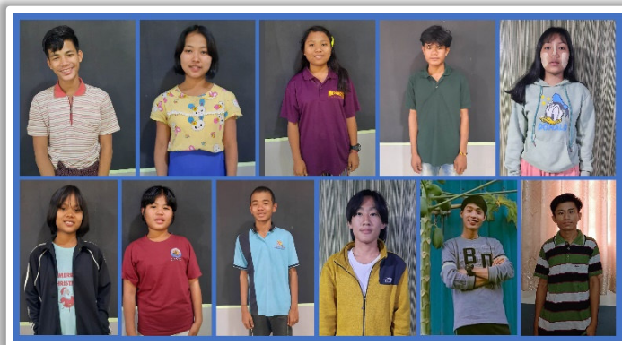
Support of students

In 2024, we will support more students and also young people in vocational training.