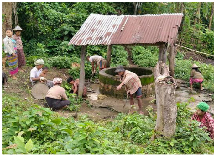
Cleaning a well in Rakhine State

Every month, 14 families living below the subsistence level were able to receive emergency financial aid for food.